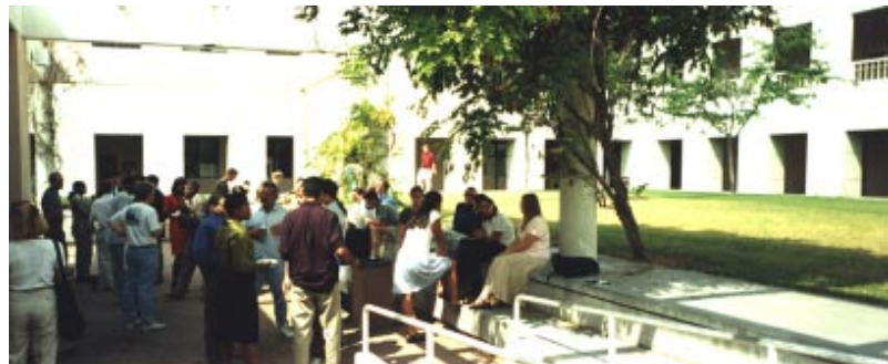
Participants take a break to enjoy the California sunshine.