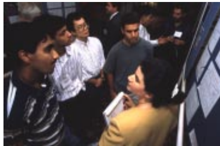
Students discuss their work with Annual Meeting participants at an afternoon poster session.

Cornell Engr Magazine, pgs 22-23, Fall 1998