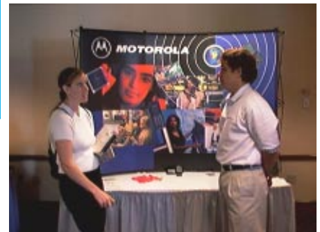
During the Career Fair, CNF Users met with Corporate Representatives to talk about the future. Advanced Micro Devices, Advantest America Inc., AMP, Eastman Kodak, Lucent Technologies - Bell Labs, Motorola SPS, Plasma Therm, and Standard Microsystems Corp took the time to meet with students and hold interviews. See below for one Career Fair Success Story!