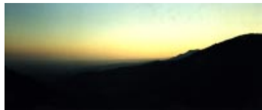
Sunset over the San Rafael Mountains